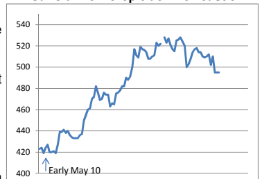
APW1 MG NTL